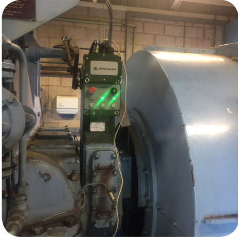
Mirrlees Blackstone 80G

Examples of UG-25+ upgrades performed by Turner ECS